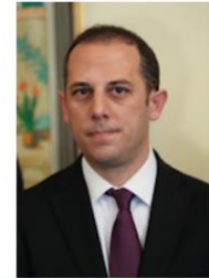
MARIOS DEMETRIADES Minister of Communications and Works of Cyprus