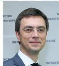
VOLODYMYR OMELYAN Minister of Infrastructure of Ukraine