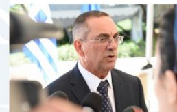
JOE MIZZI Minister for Transport and Infrastructure of Malta