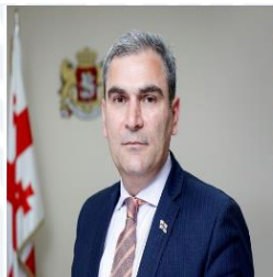
GIGLA AGULASHVILI The Minister of Environment and Natural Resources Protection of Georgia