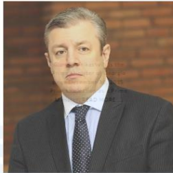
GIORGI KVIRIKASHVILI Prime Minister OF Georgia