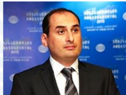
DIMITRY KUMSISHVILI Minister of Economy and Sustainable Development of Georgia and the First vice Prime Minister of Georgia