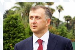
ZURAB PATARADZE Chairman of the Government of the Autonomous Republic of Adjara