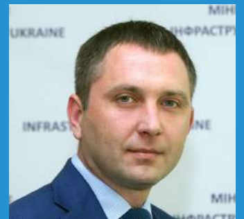
MR. YURIY LAVRENYUK Deputy Minister of Infrastructure of Ukraine