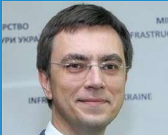
MR. VOLODYMYR OMELIAN Minister of Infrastructure of Ukraine