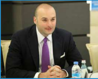
MR. MAMUKA BAKHTADZE Prime Minister of Georgia