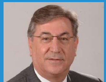
MR. KARMENU VELLA EU-Commissioner for Environment, Maritime Affairs and Fisheries