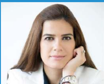
MRS. NATASA PILIDES Shipping Deputy Minister to the President of Cyprus