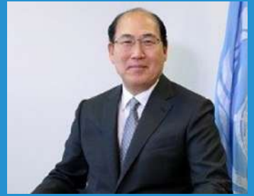
MR. KITACK LIM Secretary-General International Maritime Organization