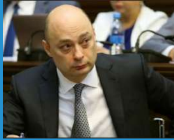
MR. GIORGI KOBULIA Minister of Economy and Sustainable Development of Georgia