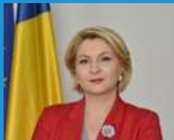
MS. MARIA MAGDALENA GRIGORE State secretary (Deputy Minister) Minister of foreign affairs of Romania